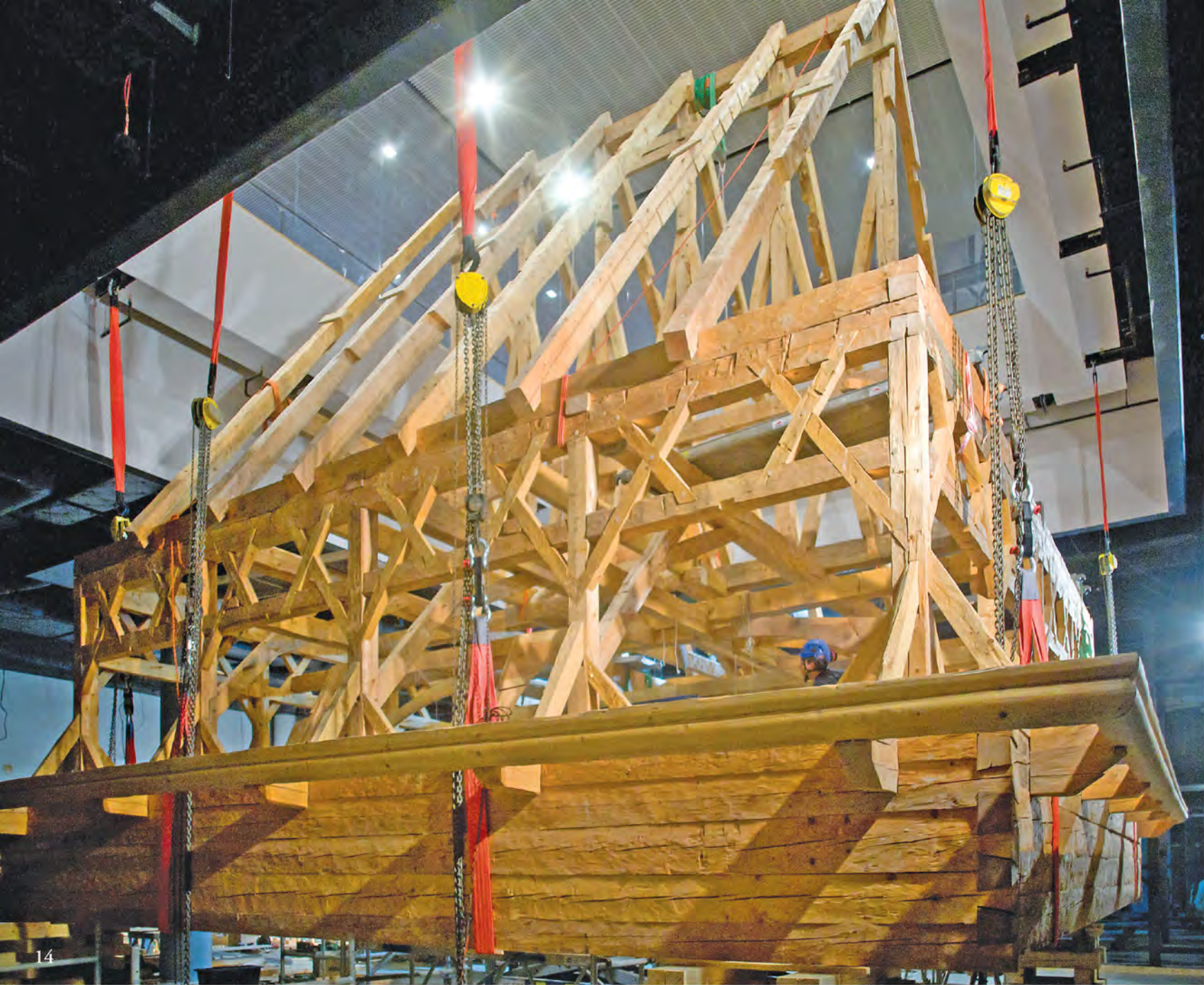
This page and below right, Magda Starowieyska, staff photographer, Museum of the History of Polish Jews, Warsaw

14 What a marvelous thing! A quick tally of the load cells revealed a preliminary weight of just under nine tons. A later tally with most of the ceiling installed and all the roof timbers yielded a weight of around 13 tons, to which some sheathing and wooden shingles were to be added. Eventually the weight to be carried by the rods would be in the range of 15 tons (the design weight was double that). We then took the opportunity to test how the frame reacted to being lifted unevenly, a likely case in the final lift. Our experiments brought next to no complaining from the frame and our pride in it only grew (Fig. 14).